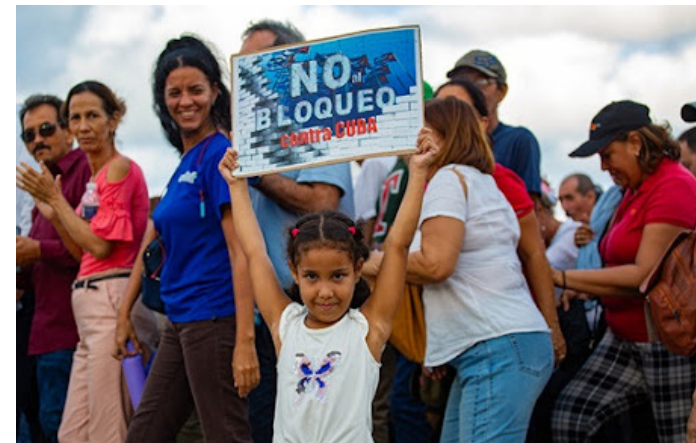
Cubans Rally in Havana Against the U.S. Blockade on Cuba. December 2024.

Recently, in its eagerness to show hostility and exert maximum pressure on the Cuban people, the White House revalidated the application of the so-called Trading with the Enemy Act (TWEA), an archaic and aggressive legal instrument passed in 1917 during World War I.