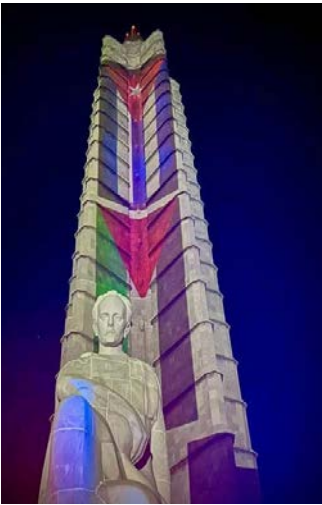
Havana statue of Cuba's National Hero Jose Marti with Cuban and Palestinian flags

Genocide, Apartheid, forced displacement and collective punishment cannot be included in today's world, nor can they be tolerated by the international community. Justice and respect for the Charter of the United Nations and international law must prevail.