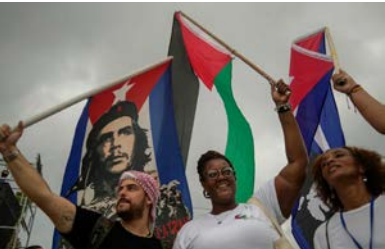
March in Solidarity with Palestine in Havana, Cuba. October 2024

Israel, with total impunity, protected by the complicity of the United States Government, ignores its obligations as the occupying Power under the Fourth Geneva Convention.