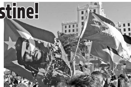
Cuban & Palestinian flags at a protest in Cuba on November 24, 2023

Genocide, Apartheid, forced displacement