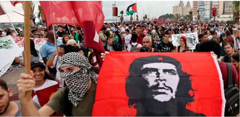
Havana marches in solidarity with Palestine, against the genocide in Gaza

Cuba’s Ministry of Foreign Affairs cubaminrex.cu