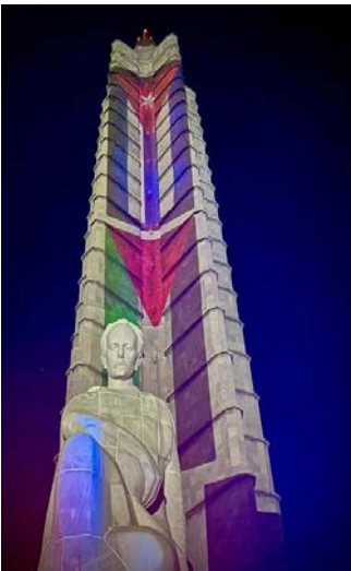
Havana statue of Cuba’s National Hero Jose Marti with Cuban and Palestinian flags

<< SCAN Read Cuba’s 2024 Report to the United Nations General Assembly on the impact of the U.S. blockade