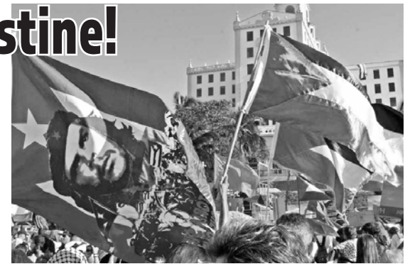
Cuban & Palestinian flags at a protest in Cuba on November 24, 2023

Genocide, Apartheid, forced displacement