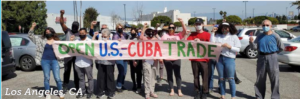
Los Angeles, CA