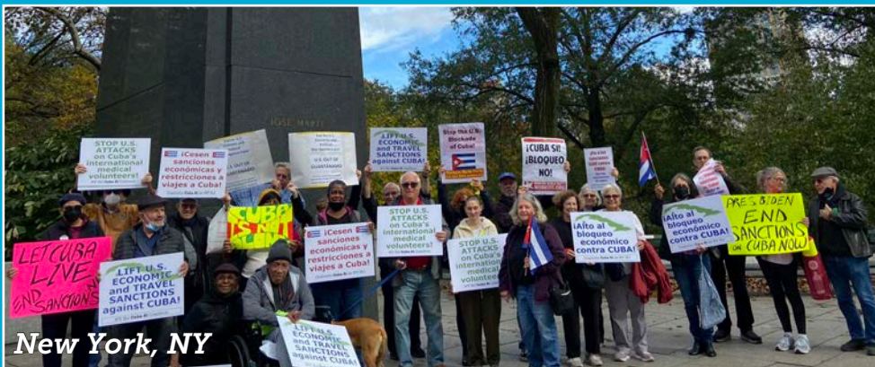
New York, NY