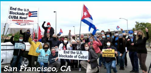
San Francisco, CA