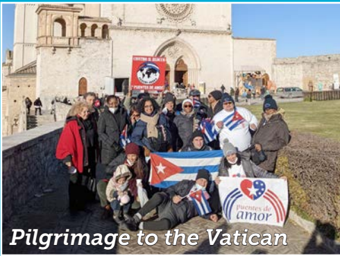
Pilgrimage to the Vatican