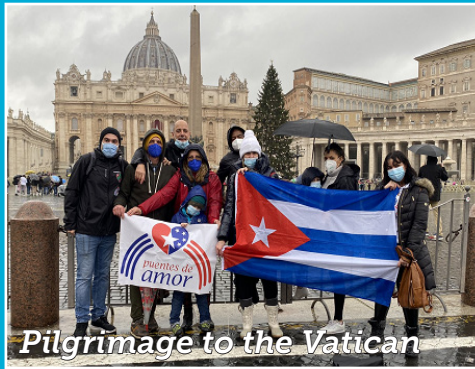
Pilgrimage to the Vatican