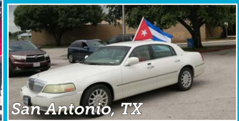
San Antonio, TX